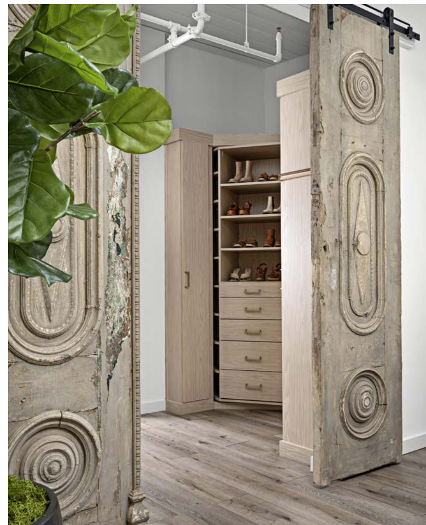
WARDROBE A 360-degree rotating closet system by Closet Works features a hidden full-length mirror and ample storage for shoes. Sourced from The Corbel , the French doors that close off the space are from the 1800s.