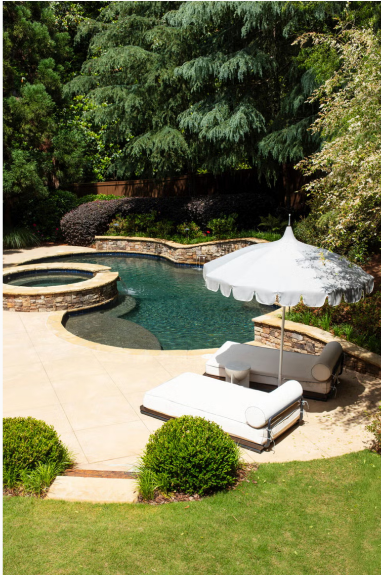
ANDY J. SCOTT

At the front of the house, they also installed hedges for extra privacy. “All three sides of the front yard have full privacy hedges, and then multi-layers of plants and flowers that bloom at different times of year,” Jett says of the standout feature.