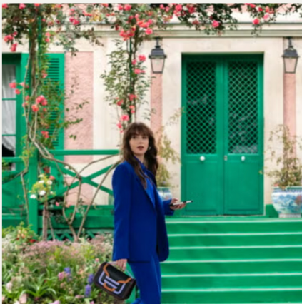
Where Was 'Emily in Paris' Season 4 Filmed?