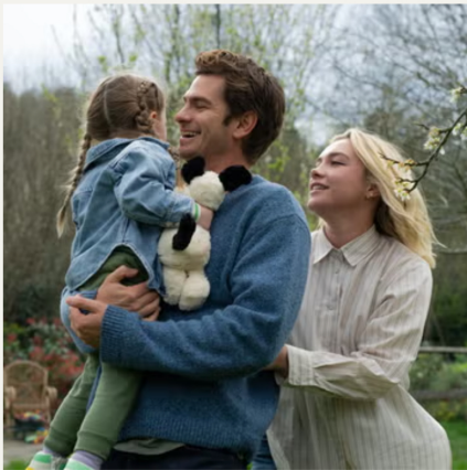
Where Was 'We Live in Time' Filmed?