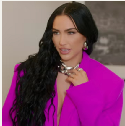
Who Is Bre Tiesi From 'Selling Sunset'?