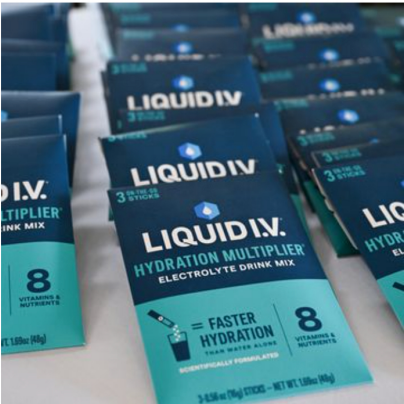
Liquid I.V. Made Hot Chocolate Hydrating