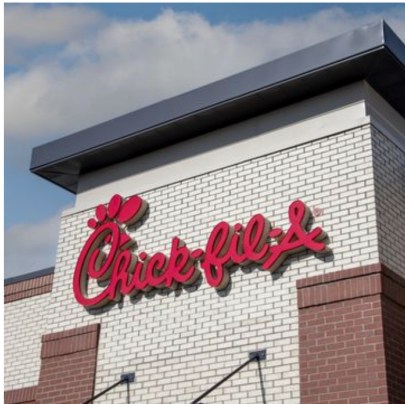
Chick-fil-A Tests Out Vending Machine