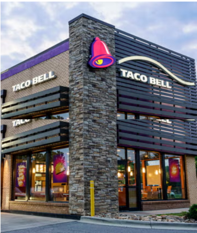
Taco Bell Turned Baja Blast Into Pie