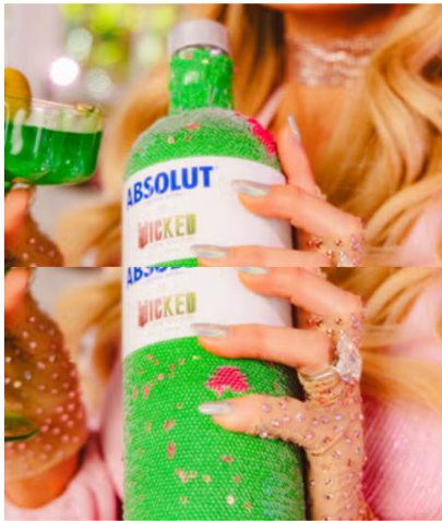
The 'Wicked' Absolut Cocktail Kit Is Back