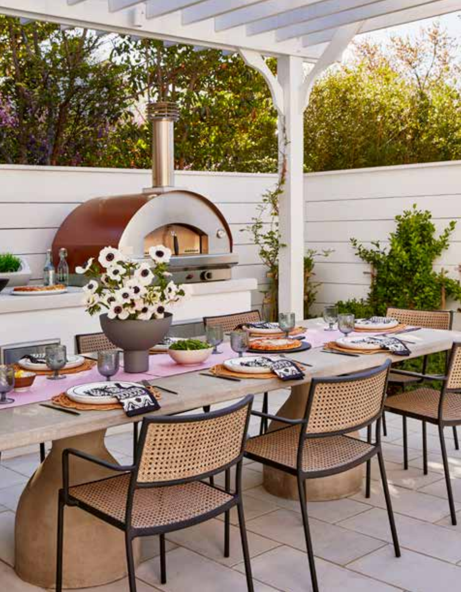
BACKYARD Set under a pergola with a retractable awning, the outdoor kitchen is equipped with a Fontana Forni pizza oven for alfresco cooking. Dining table: Made Goods . Chairs: Horne .